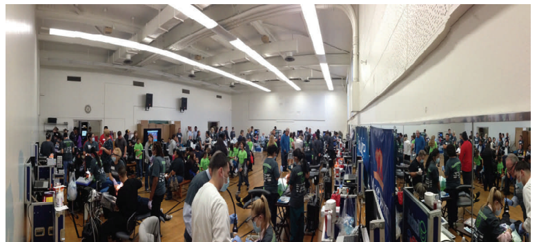
View from the South Gym at Fresno State during TeamSmile

More of the story in the December Grapevine